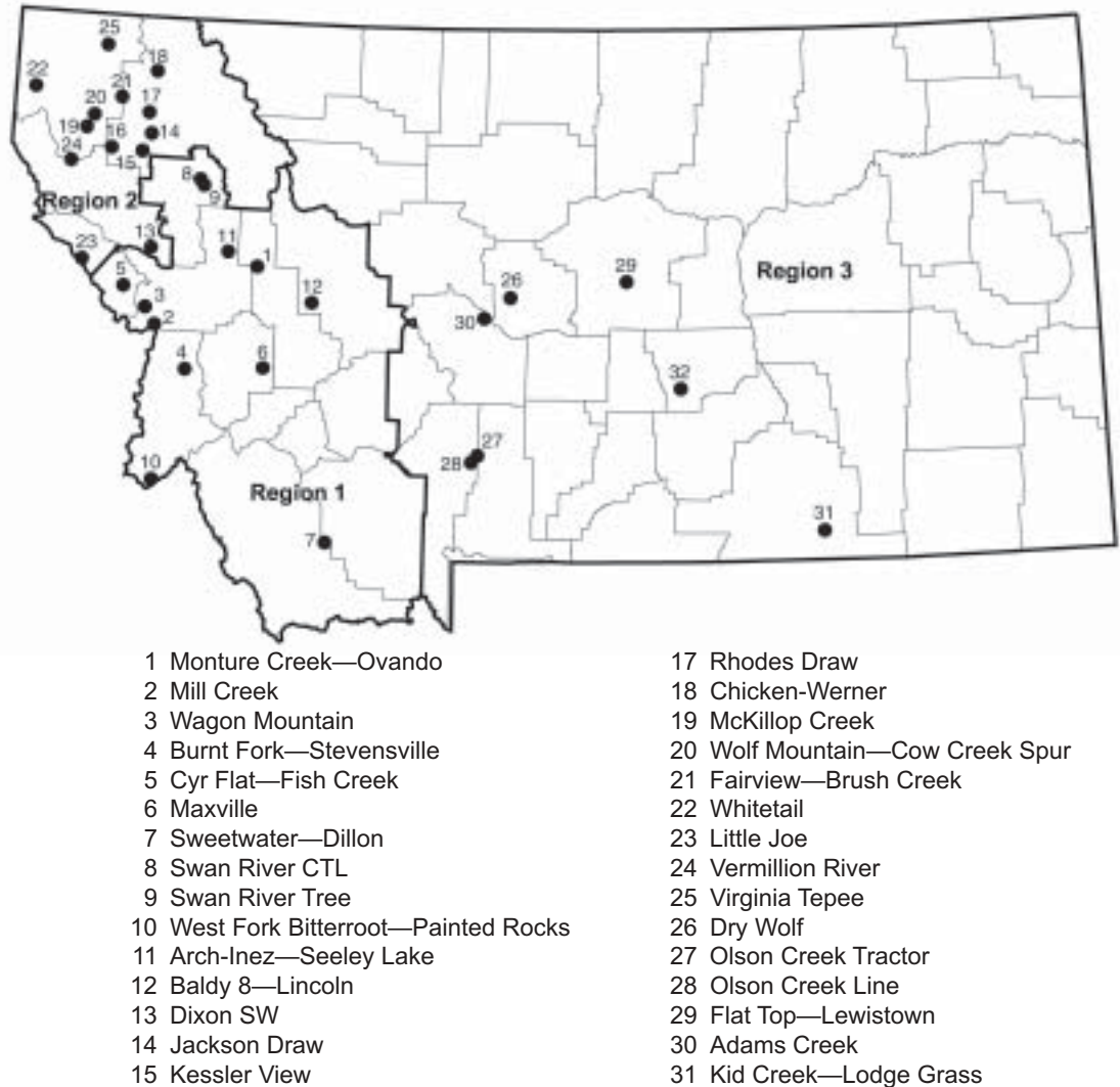
16 Leo's Lament—Bar Z Mountain