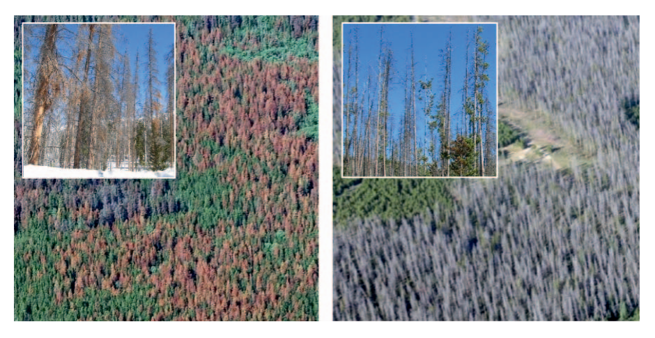
Figure 1.—Forest and trees (inset) in the red stage (left) and gray stage (right) following a mountain pine beetle outbreak. (Color version is available online.)

what is known as the fall stage. Affected trees can be harvested at any stage. However, in the green and red stages and potentially into the early gray stage, the trees retain some portion of their commercial value, depending on species and condition, allowing for financially feasible beetle-kill salvage harvests.