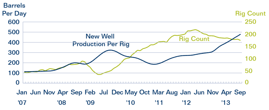
Figure 2 Bakken New Well Oil Production Versus Rig Count